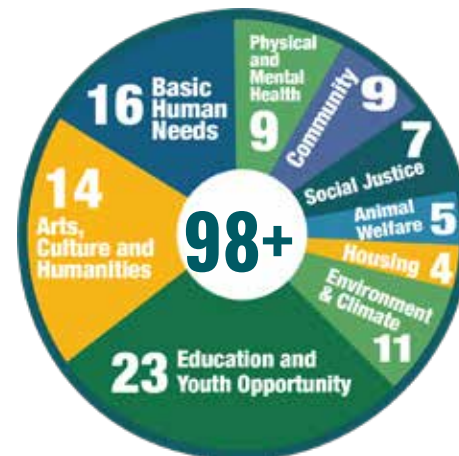
2025 NONPROFIT SERVICE CATEGORIES