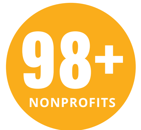
2025 NUMBER OF LOCAL NONPROFITS SERVED BY JCF