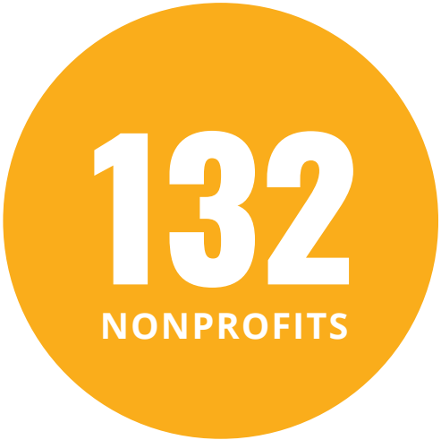
2024 NUMBER OF LOCAL NONPROFITS SERVED BY JCF