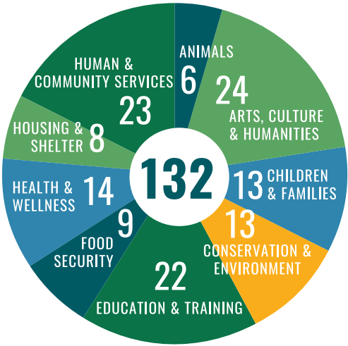
2024 NONPROFIT SERVICE CATEGORIES