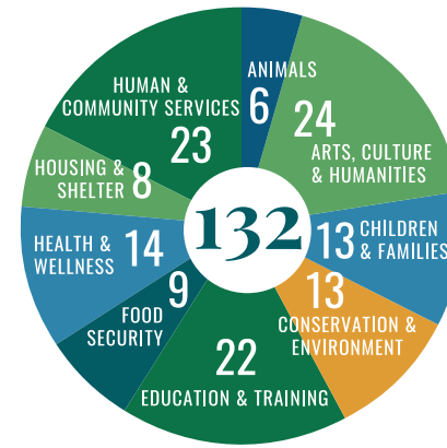
2023 NONPROFIT SERVICE CATEGORIES