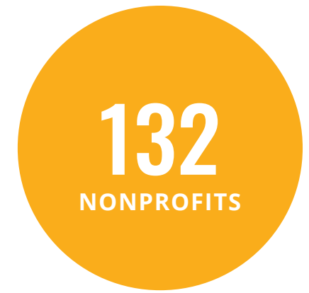
2023 NUMBER OF LOCAL NONPROFITS SERVED BY JCF