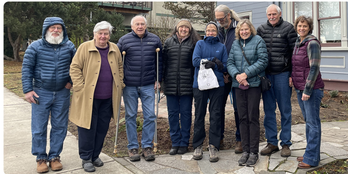
Vintage Gratitude Giving Circle focused their resources on youth mental health and empowerment.