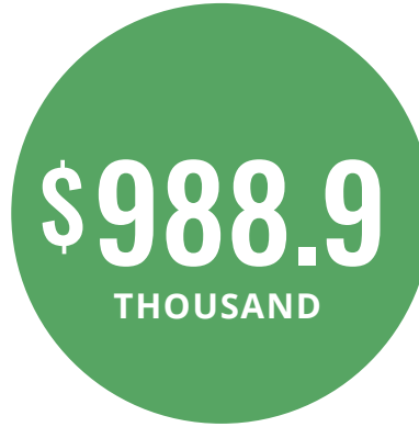
2022 GRANTMAKING DIRECT FROM JCF HELD FUNDS