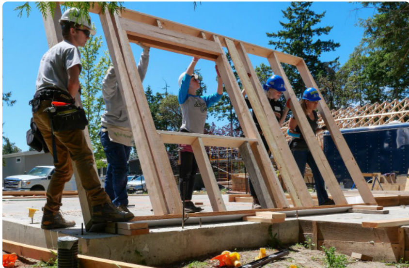
JCF donors helped Habitat for Humanity buy land to build permanently affordable workforce housing.