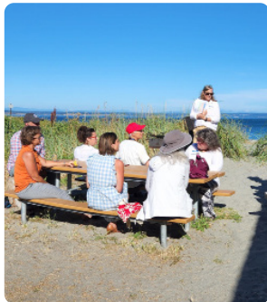
JCF hosted quarterly nonprofit executive director networking events.