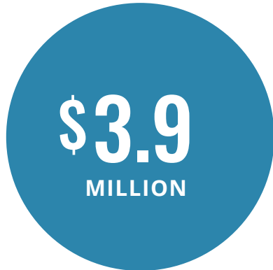
2022 TOTAL ASSETS UNDER MANAGEMENT