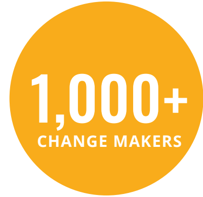
2022 ESTIMATED NUMBER OF CHANGE MAKERS IN THE JCF NETWORK