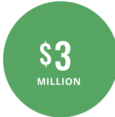
2022 EXTERNAL GRANTMAKING ADVISED/FACILITATED BY JCF