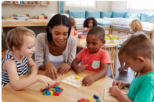
JCF convened monthly child care network meetings to co-create solutions to the county's shortage of child care.