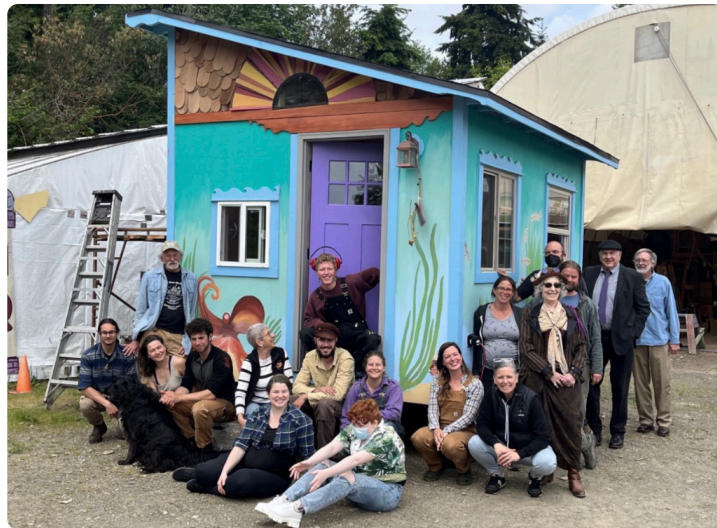
Through relationships made through JCF, Community Boat Project secured $200,000 in additional funding.