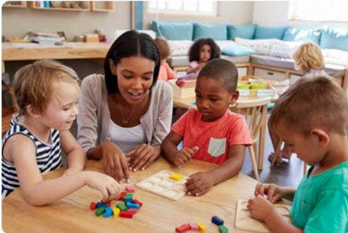
JCF convened monthly child care network meetings to co-create solutions to the county's shortage of child care.