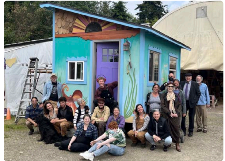
Through relationships made through JCF, Community Boat Project secured $200,000 in additional funding.