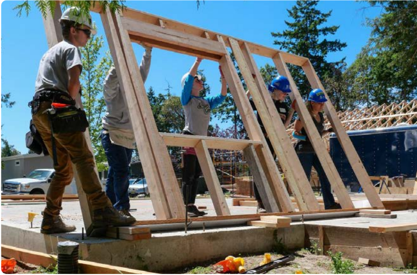
JCF donors helped Habitat for Humanity buy land to build permanently affordable workforce housing.