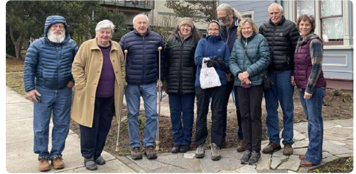
Vintage Gratitude Giving Circle focused their resources on youth mental health and empowerment.