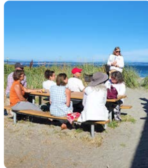
JCF hosted quarterly nonprofit executive director networking events.